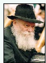
Lubavitcher Rebbe Menachem M. Schneerson

You have to do something. What you choose is not the issue here. Neither are all the neat little